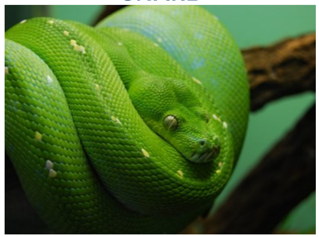
How Does This Animal Deal With Conflict?