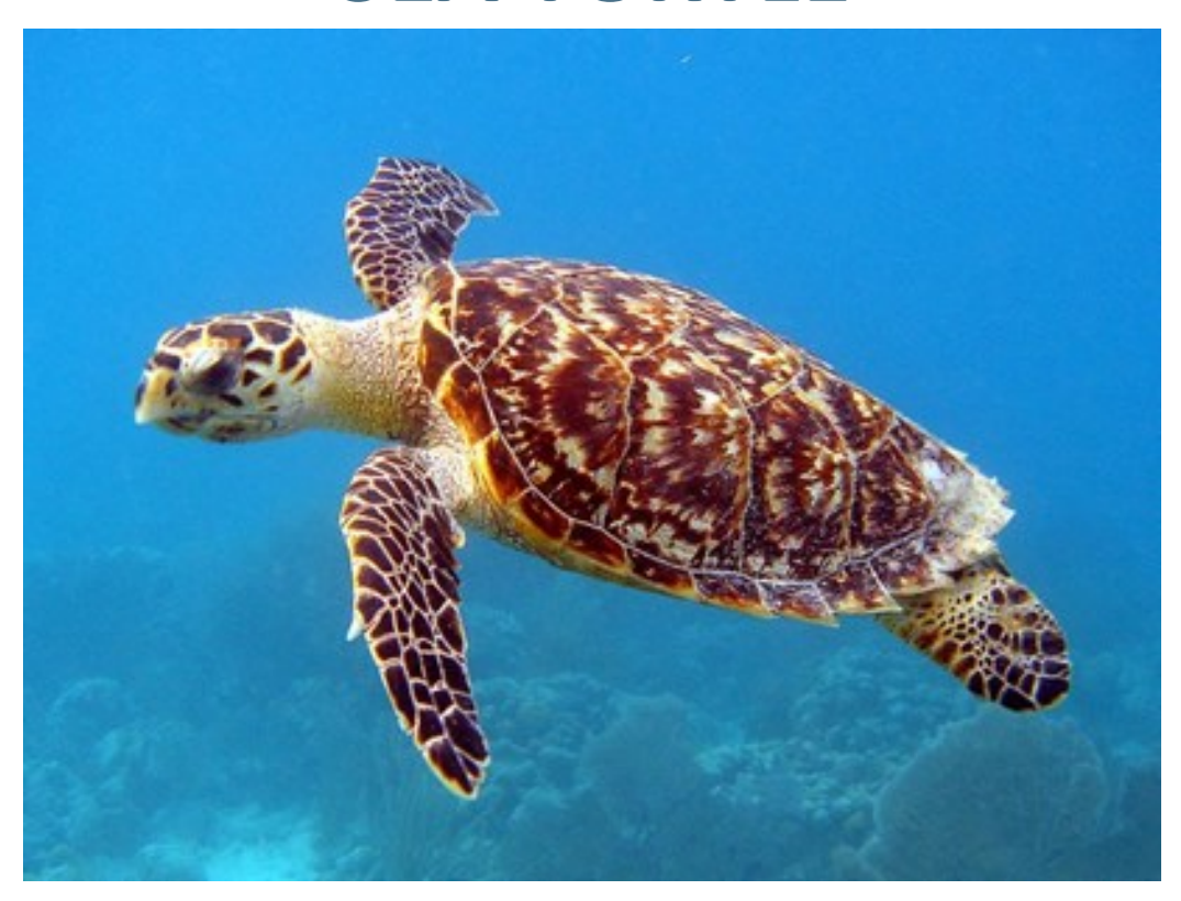
How Does This Animal Deal With Conflict?