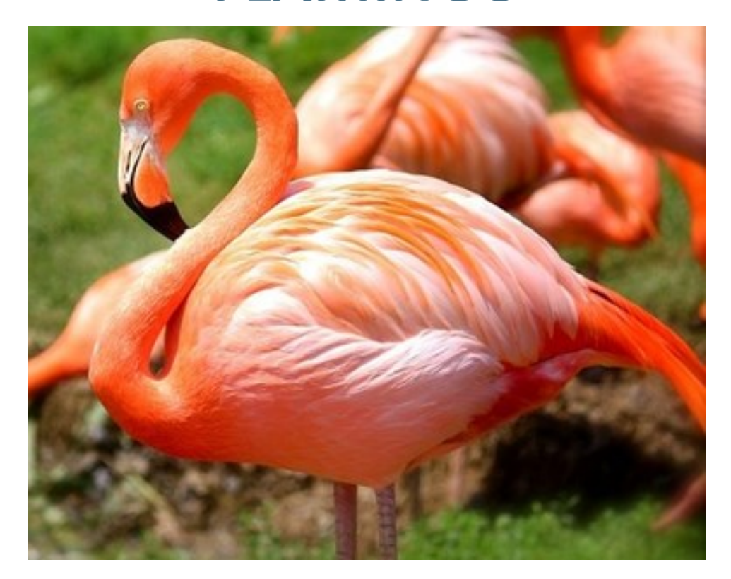
How Does This Animal Deal With Conflict?