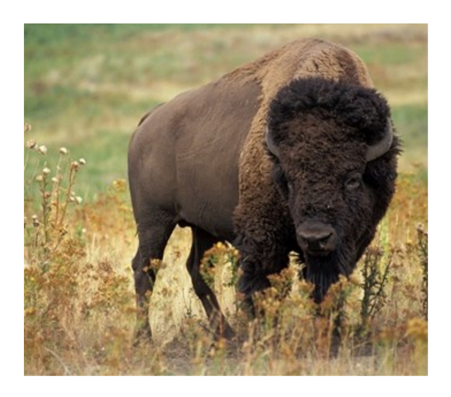
How Does This Animal Deal With Conflict?