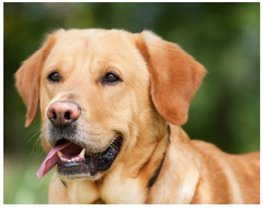
How Does This Animal Deal With Conflict?