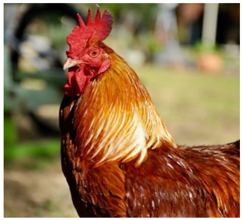
How Does This Animal Deal With Conflict?