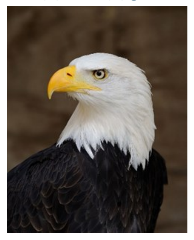
How Does This Animal Deal With Conflict?