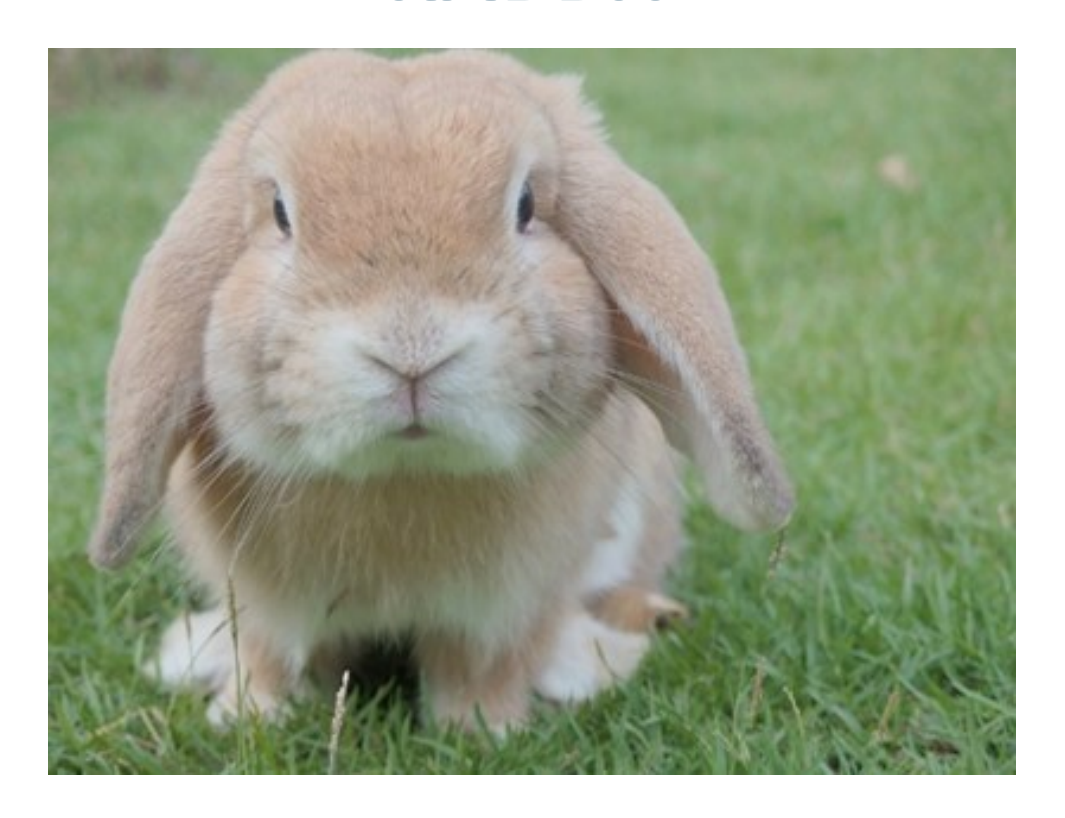
How Does This Animal Deal With Conflict?