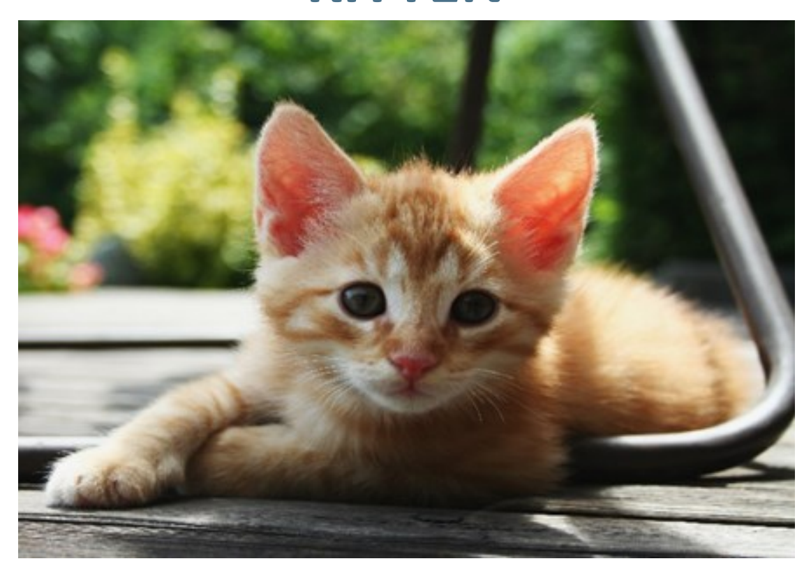
How Does This Animal Deal With Conflict?