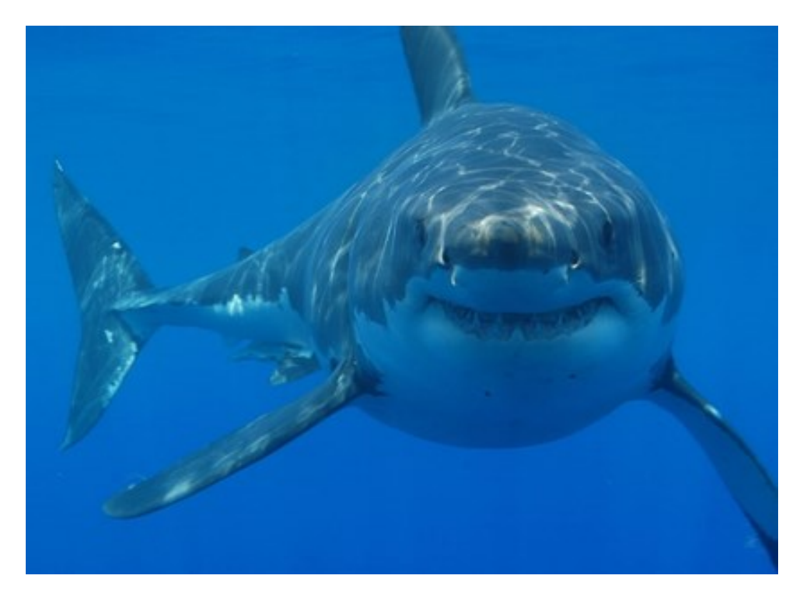
How Does This Animal Deal With Conflict?