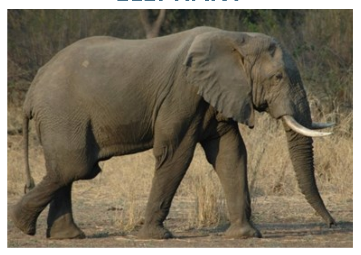
How Does This Animal Deal With Conflict?