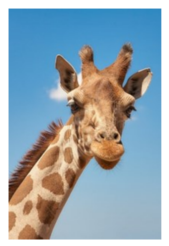
How Does This Animal Deal With Conflict?