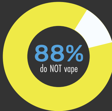
Middle School Students

Most Wheeling Township teens make the healthy decision to NOT vape