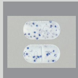
PHENTERMINE (PHENTERMINE HYDROCHLORIDE)