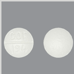
BENZPHETAMINE (BENZPHETAMINE SYSTEMIC 50 MG)