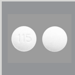
METHAMPHETAMINE (METHAMPHETAMINE SYSTEMIC 5 MG)