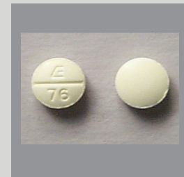
PHENDIMETRAZINE (PHENDIMETRAZINE 35 MG)