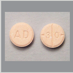
AMPHETAMINES (ADDERALL 30 MG)

There are various types of stimulants that differ in strength depending on the time and amount taken. Images of the drugs listed or shown below vary in appearance based on their physical and chemical makeup and may look different depending on the manufacturer. This is not a comprehensive list of all stimulants. Please use this as a reference, but always refer to your doctors or healthcare professional with any questions or concerns.