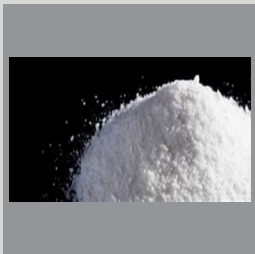
SYNTHETIC CATHINONES (“BATH SALTS”)