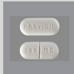
COCAINE (PROVIGIL 200 MG)