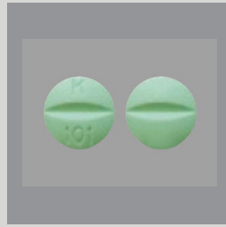
METHYLPHENIDATE (METHYLPHENIDATE SYSTEMIC 10MG)